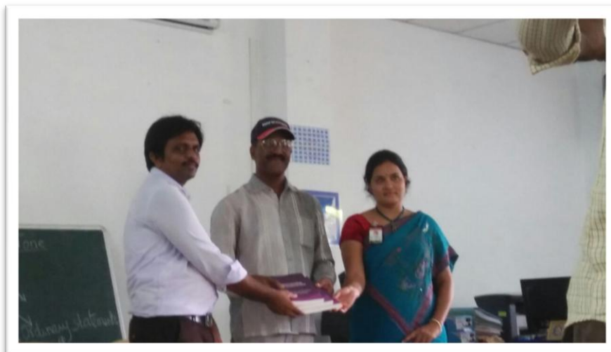
Presenting the books to the English faculty